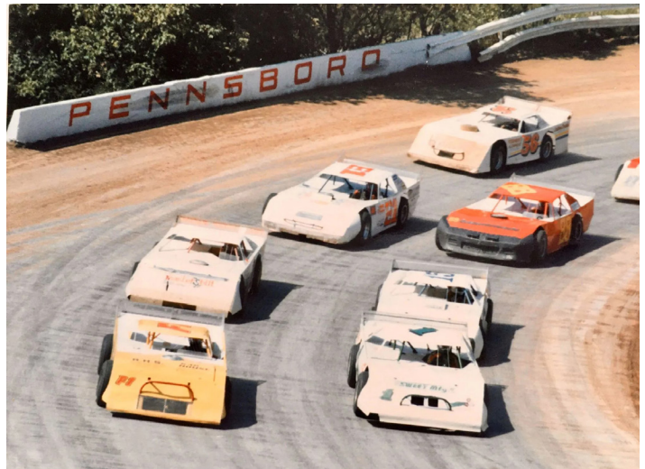
The legendary Pennsboro Speedway with Late Models on the track is set to make a return to racing, which is great news for the entire sport.

The Pennsboro Speedway revitalization project, led by XR Events and supported by the Ritchie County Fairground board, encountered and surmounted the customary challenges and adjustments inherent in any construction undertaking. Adhering to strict hillside regulations, the project led to the reduction of the track’s width, although this was ingeniously offset by a lengthening that created a spacious track design. Drawing inspiration from renowned tracks such as Davenport Speedway in Iowa (layout), Fairbury Speedway in Illinois (banking), and the former Legendary Hilltop in Ohio (size), the construction team is meticulously crafting a cutting-edge track model that promises to deliver an unparalleled racing experience.