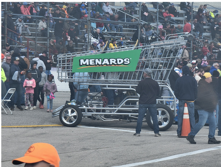
Menard's is the ARCA Series and event sponsor. The "giant" Menard's shopping cart was a huge attraction and paced the field prior to the green flag being displayed.