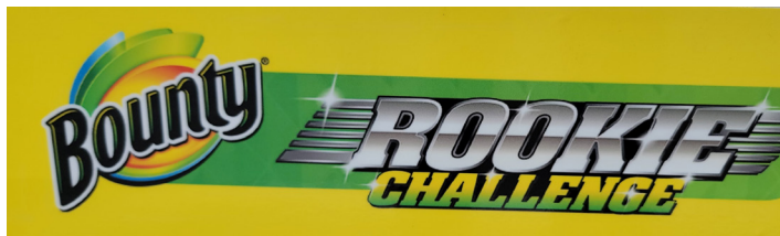
The "Bounty Rookie Challenge" is an ARCA program with this as part of the "yellow rookie stripe" on the bumper of candidates cars. This provides marketing partners a unique opportunity and a new potential sales point at your track.