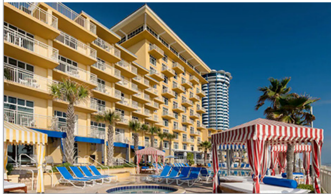
(TOP) LOCATION OF 51ST ANNUAL RPM RENO WORKSHOPS, SILVER LEGACY, RENO, NEVADA (BOTTOM) LOCATION OF 51ST ANNUAL RPM WORKSHOPS, THE SHORES RESORT, DAYTONA BEACH, FLORIDA

Booking information for Reno is available at this link; The group code is SRRPM23; https://book.passkey.com/go/SRRPM23 (Room Reservations begin at $55.00 per night).