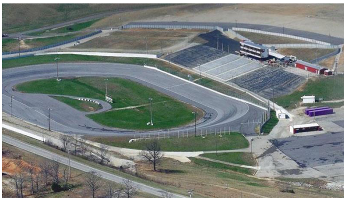
Lebanon I-44 Speedway in Missouri.