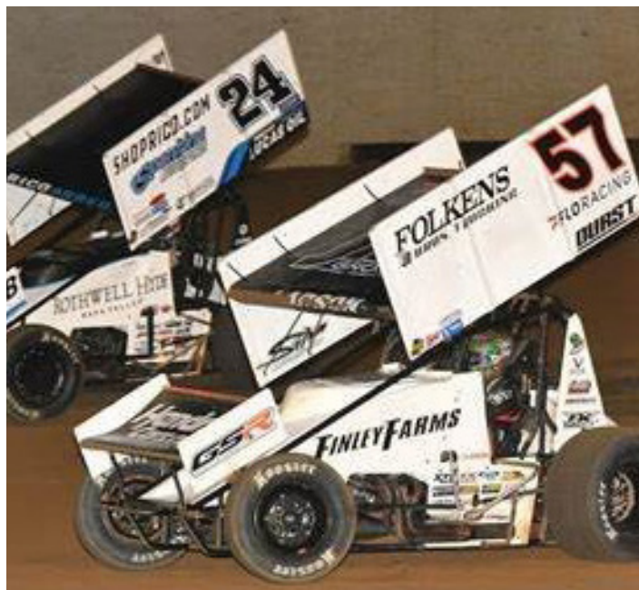
Kyle Larson and Rico Abreu battle in High Limit Sprint Car action. Both are familiar competitors to everyone engaged in Sprint Car racing.