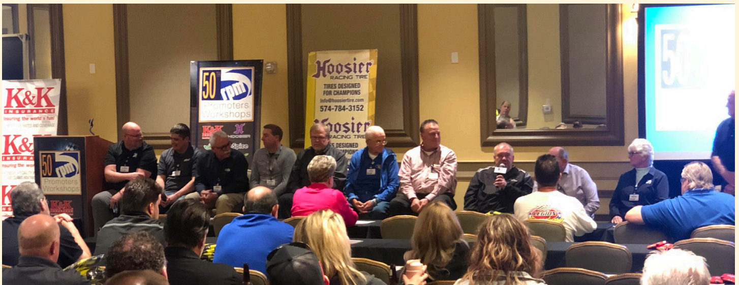
A photo of the popular "Ask an ARPY" session at the 50th Annual RPM@Daytona Workshops last year at "The Shores".